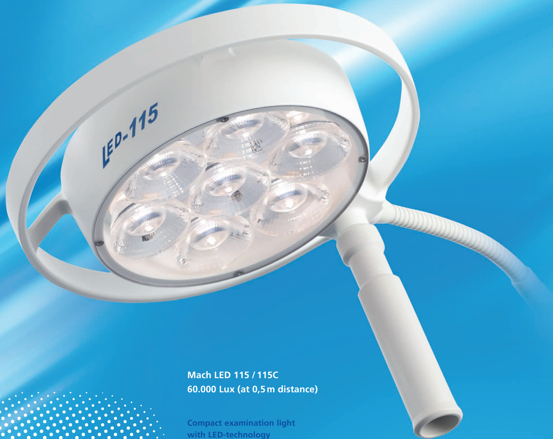
Mach LED 115 / 115C 60.000 Lux (at 0,5m distance)

Compact examination light with LED-technology for diagnosis and prophylaxis